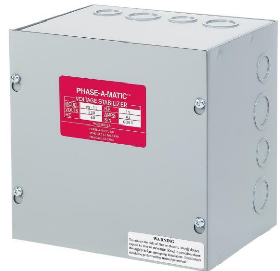
Model VS-15 Shown

PHASE-A-MATIC, INC. 39360 3 rd St. E., Suite 301 · Palmdale, Ca. 93550-3255 Toll Free 800-962-6976 · Local: 661-947-8485 FAX 661-947-8764 · Email: info@phase-a-matic.com